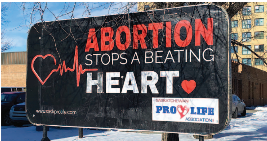
This sign witnessing to the sanctity of human life is located in front of St. Mary's Church on Winnipeg Street, Regina. It has been up since mid-December, 2023.

LIFE IS PRECIOUS Happy Mother's Day, May 12