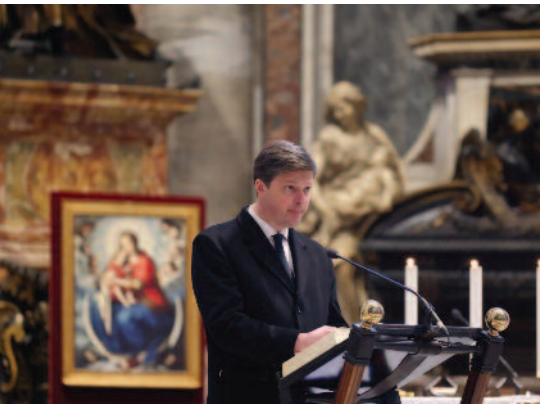
Eduard Habsburg-Lothringen, Ambassador of Hungary to the Vatican

There's something a bit weird about seeing a Habsburg pop up on Twitter. If 54-year-old Eduard Habsburg's surname seems familiar, that's because his family ruled Austria for more than six centuries. The Habsburg dynasty began in 1273 when Rudolf I was elected King of Germany, boasted emperors of the Holy Roman Empire, and only ended in 1918 when the cataclysm of the Great War forced Charles I from his throne and into exile in Switzerland. Eduard himself is the great-grandson of Franz Joseph I, Emperor of Austria, and King of Hungary, Croatia, and Bohemia.