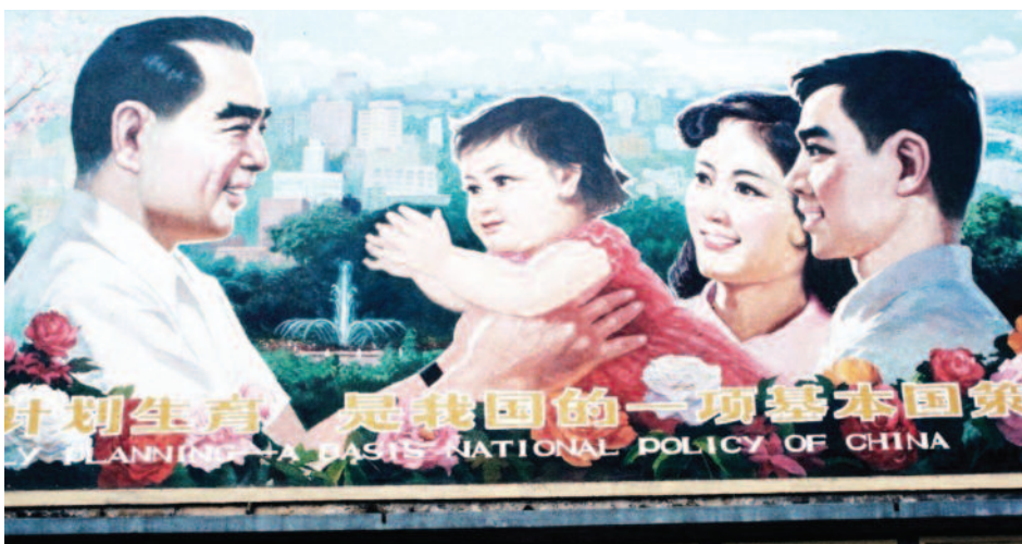
1980s Chinese Communist propaganda poster.