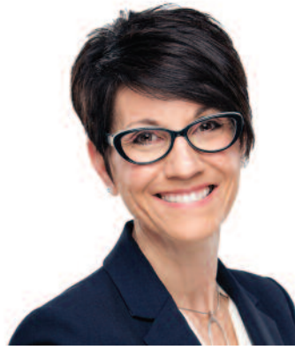
Kelly Block, MP

But many on the political left are determined to command our medical professionals: Thou SHALT kill! In light of the 2019 Ontario court ruling, and given the passage of Bill C-7 (euthanasia expansion), many concerned individuals, including some virtuous political leaders, are rallying to protect our health care workers and the patients they serve. They want to salvage our healthcare system from total destruction.